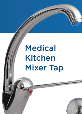
Medical Kitchen Mixer Tap