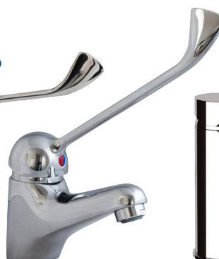
Compact Medical Basin Tap