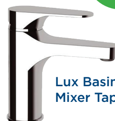
Lux Basin Mixer Tap